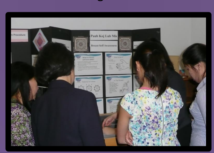
CHW demonstrating breast self-examination

All CHWs demonstrated positive changes in knowledge and selfefficacy by the end of the training sessions.